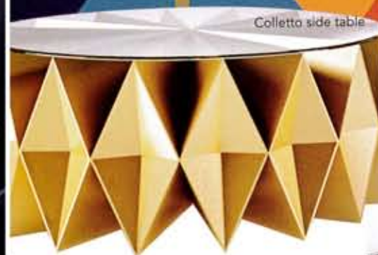
Colletto side table