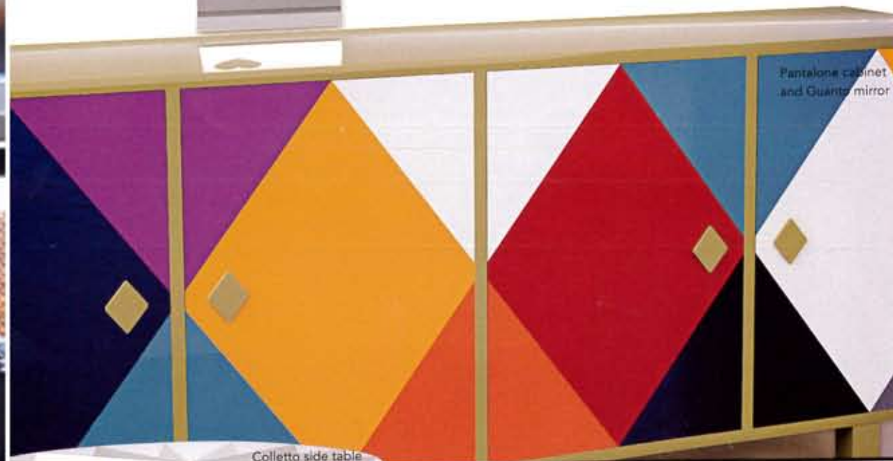
Pantalone cabinet and Quarto mirror